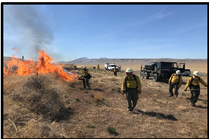
Blue Mountain RFPA & Vale BLM prescribed burn

Additionally, in early September, twenty-eight members of the Ashwood-Antelope RFPA conducted a 400 acre prescribed burn east of Hwy 97 helping the landowner to achieve their rangeland enhancement goals.