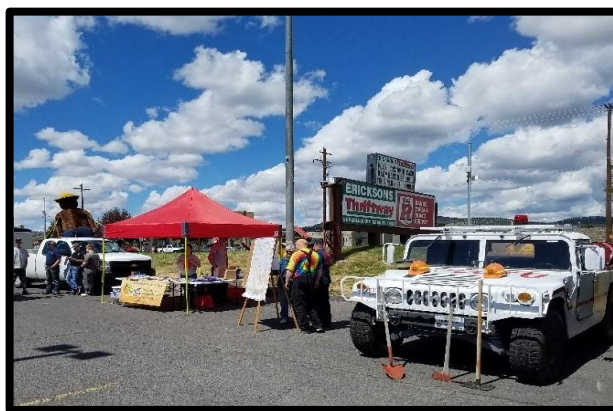
Public Fire Prevention Event in Burns