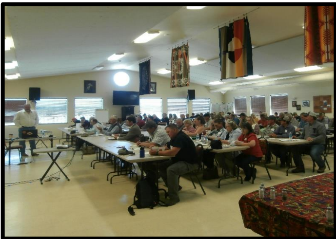
RFA Members at the 2018 Rangeland Summit

The annual Rangeland Summit in Burns was attended by 116 people, a 31% increase from the previous year. Attendees included representation from RFA members, state of Oregon and federal partners, county staff, utility companies and members of the Burns-Paiute Tribe. The RFPAs devoted much of this year's agenda towards continued commitment to enhancement of their program, including a listening session on lessons learned from the previous fire season and an in-depth training presentation on member recruitment and retention.